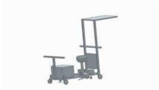
Figure 2 Cad model