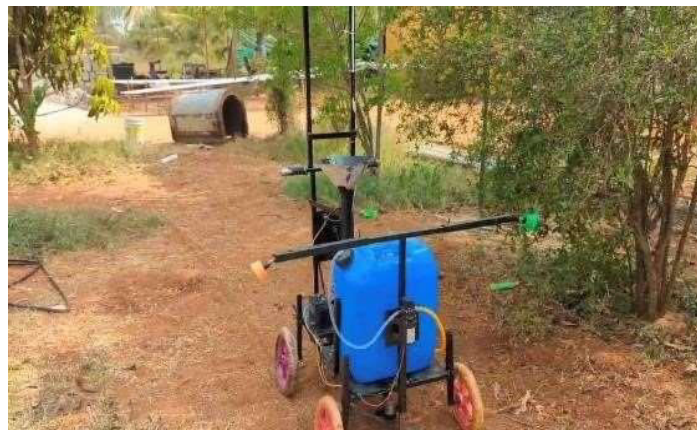
Figure 1- Multi-Operational Agro Machine

The integrated pesticide sprayer features adjustable nozzles and a high-capacity tank, enabling precise and effective application of pesticides, thus protecting crops from pests and diseases.