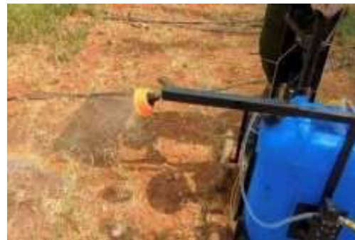
Figure 4 &5 Working on field