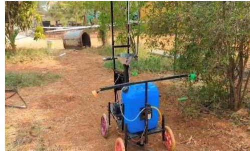
Figure 3 Multi purpose agro machine