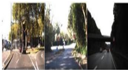
Figure 4: GTSDB Dataset

Yi Yang et al [3] [14] details the problem of traffic sign identification. In this paper there are two fast algorithms that detects and classifies the traffic signs respectively. Here, a color probability model is developed to extract the colours from traffic signs and put away the background colours and to decrease time they used SVM and CNN to recognize the traffic signs and they tested it with the CTSD dataset. Support Vector Machines are a supervised machine learning model, it is used for both classification and regression analysis. It uses a hypervisor as a dividing plane between classified and unclassified objects by representing the points in space. They used the color probability model and MSER region detector to get the traffic signs from the model.