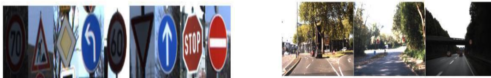
Figure 2: GTSRB Dataset

Liu Wei et al [12] [13] introduced transfer learning to detect and identify the traffic signs and this model is trained on CIFAR-10 dataset. Transfer learning is research based on machine learning. It concentrates on gathering information while solving one problem and uses the information and knowledge to solve a different problem which is related to the first problem. CIFAR-10 is developed by the Canadian Institute for Advanced Research and it contains 60,000 images with 10 classes that contains airplanes, horses and different things. CIFAR-10 has low resolution images which is a benefit for researchers to try algorithms quickly. CIFAR-10 is used to train R-CNN on stop sign object detector.