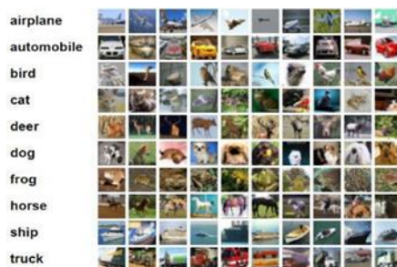
Figure 3: CIFAR-10 Dataset

Yi Yang et al [3] [14] details the problem of traffic sign identification. In this paper there are two fast algorithms that detects and classifies the traffic signs respectively. Here, a color probability model is developed to extract the colours from traffic signs and put away the background colours and to decrease time they used SVM and CNN to recognize the traffic signs and they tested it with the CTSD dataset. Support Vector Machines are a supervised machine learning model, it is used for both classification and regression analysis. It uses a hypervisor as a dividing plane between classified and unclassified objects by representing the points in space. They used the color probability model and MSER region detector to get the traffic signs from the model.