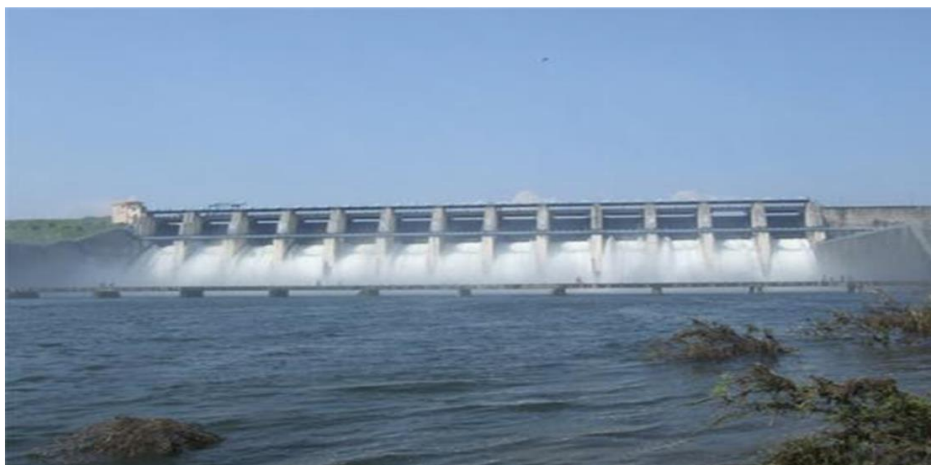
Upper Wardha Dam

In the year 1983, on 9th of August, Amravati water supply scheme was handed over to then Maharashtra Water Supply & Sanitation Board by Municipal Council, Amravati. In ancient times, Amravati city was dependent on few tube wells, some trenches in city having horizontal bores to receive water from nearby areas, open dug wells and lake - Chatri Talao. Also there were local tube wells in different areas of city which served the nearby areas. Chlorination was done using bleaching powder. Also water was supplied from nearby village Revsa which is 15km away from city. The entire network was of GI pipeline having many stand posts and few individual connections. A small treatment plant of 25MLD was built near Maltekdi in which water coming from Revsa village was treated and then supplied to city. The overall system was run on pumping having multiple pumping stations nearby tube wells, open wells, trenches and lake. Due to pumping, water supply was totally dependent on electricity. The system was like a tree root system in which different sources from multiple locations were used to serve the need of city to flourish it like a tree. Some structures viz. Benoda Trench, Chatri talao, Open wells and few tube wells are still present in deteriorated condition. But as city started developing, this supply was not enough to quench the thirst of flourishing city.