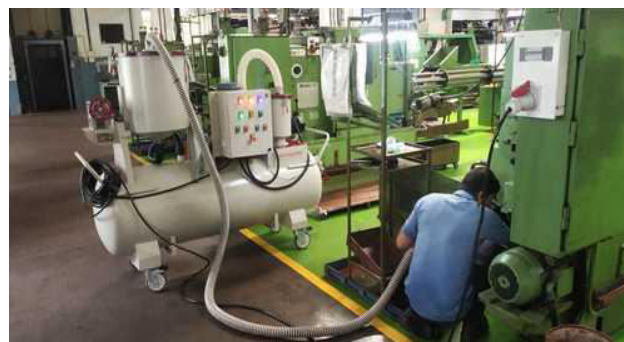
Fig. During Testing of System