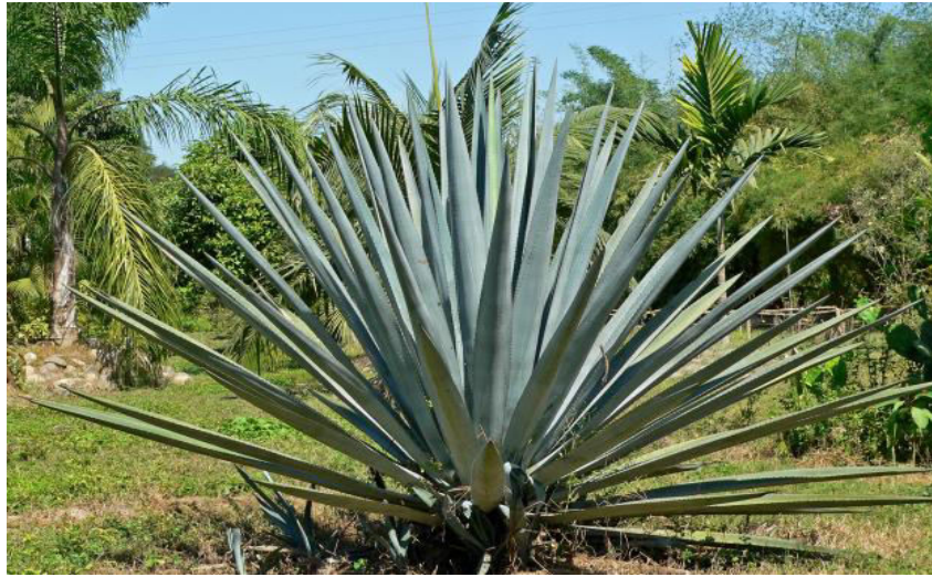
Fig. 1.0 AGAVE PLANT