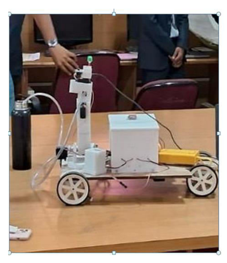
Figure 1. Physical Model